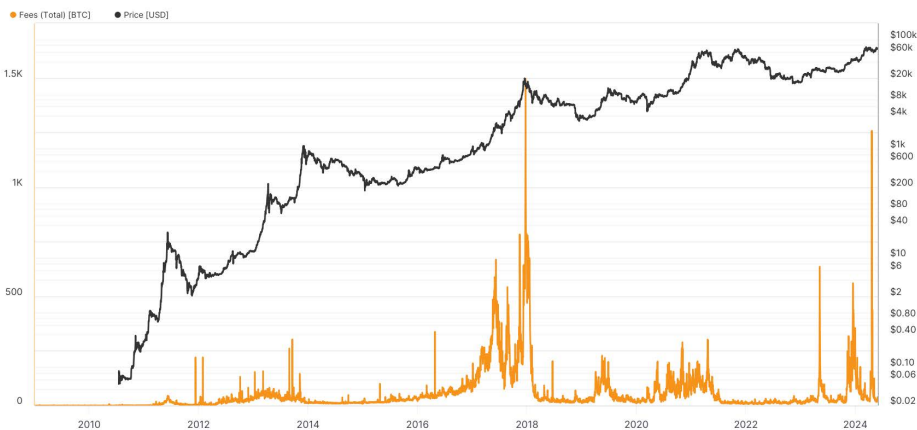
Bitcoin: Total Transaction Fees [BTC]