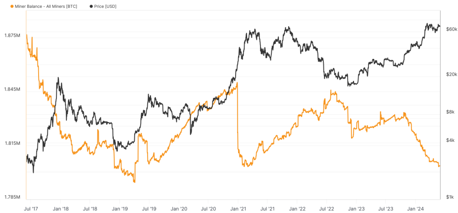
Bitcoin: Balance in Miner Wallets [BTC] - All Miners